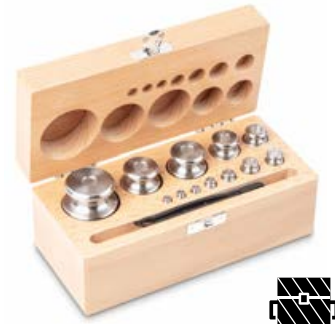
Wooden case, for weight sets, knob shape, finely turned stainless steel