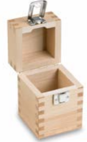
Wooden box, not lined, for individual weights \geq 1 kg