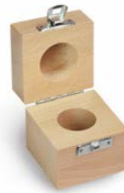
Wooden box, not lined, for individual weights \leq 500 g