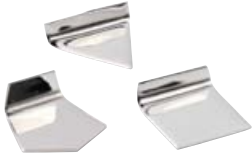
Milligram weights, flat polygonal sheet