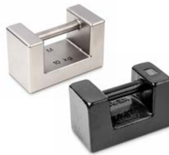
Block weights, lacquered cast iron/stainless steel glass bead blasted, optional: Aluminium protected case, lined