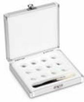
Milligram weight set in aluminium protected box, lined (348-226)