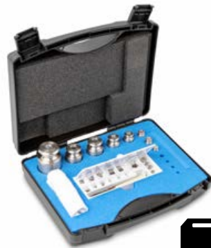
Plastic case, lined, for weight sets, knob shape, finely turned stainless steel