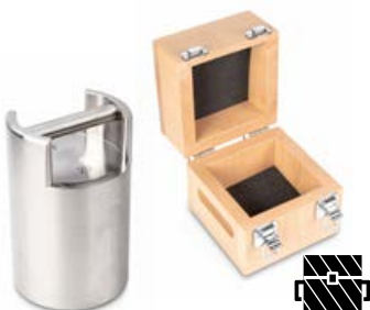
Test weights (10 - 50 kg), finely turned stainless steel KERN 347-141 ff, optional: Wooden box