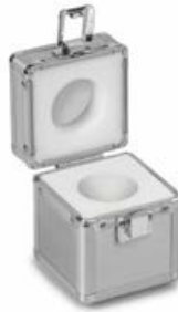
Aluminium protected box, lined, for individual weights