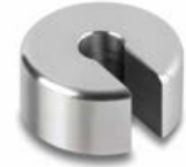
Slotted weights, finely turned stainless steel