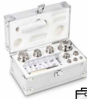
Aluminium protected case, lined, for weight sets, knob shape, finely turned stainless steel