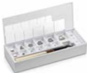
Milligram weight set in plastic box (348-22)